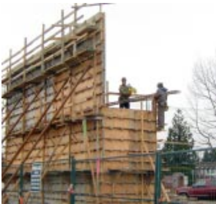
Wood frame of the Sanctuary 建造聖所石牆作準備的棚架