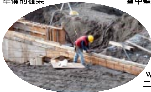
Work process in February 二月期間工程進行情況