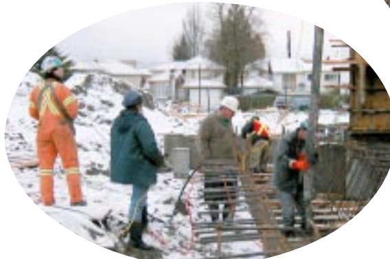
Sanctuary foundation work in snow 雪中聖所地基工程施工情況