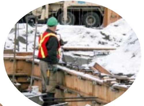
Work in snow 工匠雪中勤奮工作