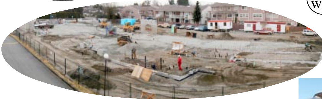
Panorama view of the construction site in March 三月初聖堂地盤全貌