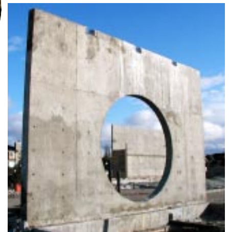
Office round window 堂區辦公室大圓窗