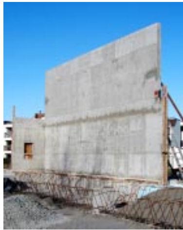
Sanctuary Wall 聖所石牆