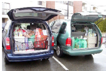
Our parish Youth Ministry carried Christmas Hampers to needy families. Dec 23 本堂青年牧民遞送聖誕禮物包給有需要的家庭