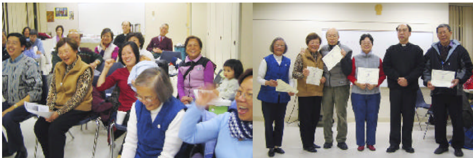
RCIA catechists Christmas / New Year party. 成人慕道班導師聖誕新年晚會 Jan 2