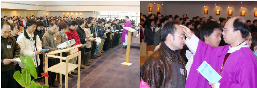
The RCIA catechumens received the Rite of Acceptance. Dec 3 成人慕道者接受收錄禮