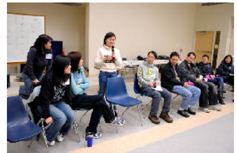
Catholic Open House Appreciation Night 天主教開放日感恩晚會 Jan 13