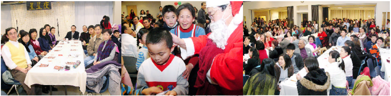
Christmas dinner party filled with blessings and joy. Dec 16