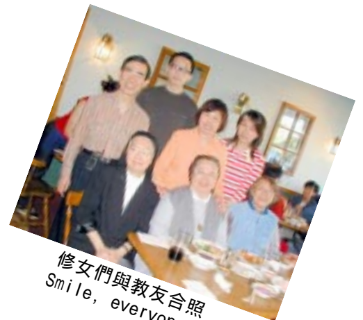
修女們與教友合照 Smile, everyone!