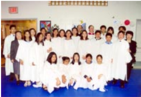
兒童道理班初領聖體及領堅振 Confirmation and First Holy Communion of PREP Children May 15, 2002