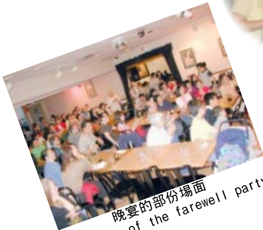
晚宴的部份場面 A corner of the farewell party