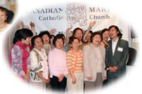
粵語聖母軍合唱軍歌 Legion of Mary (Cantonese) sings together