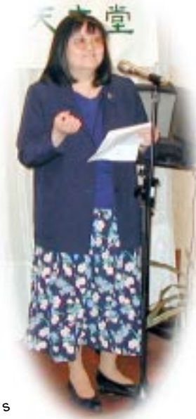
教友代表表心聲 A word of thanks from parishioner