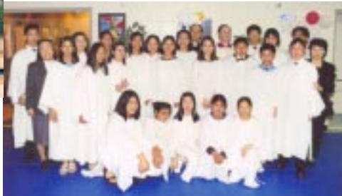
廿六位兒童領受堅振聖事 26 children of our parish received the Sacrament of Confirmation (May 15, 02)