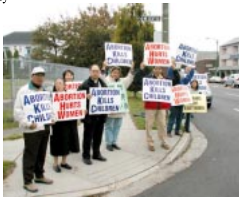
本堂參加維護生命鍊鎖主日 Our parish joined the Life Chain (Oct 6, 02)