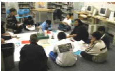
兒童道理班採用英語授課 All PREP classes in English (Sep, 02)