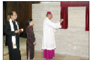
Blessing by Archbishop