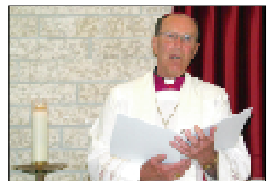
Archbishop's words of thanks