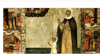
Quiricus or Cyricus

對於這年輕殉道者在戴克里先迫害時被俘的情形有不同的故事。其中一個版本是在他三歲時因抓破塔爾蘇斯市長的臉而被拋下樓梯。另一版本說這幼兒因公開宣認自己的信仰而與母親一起殉道。無論那一個版本，名叫 Cyricus 或「Ric」都與這年輕殉道者有極強的聯繫。